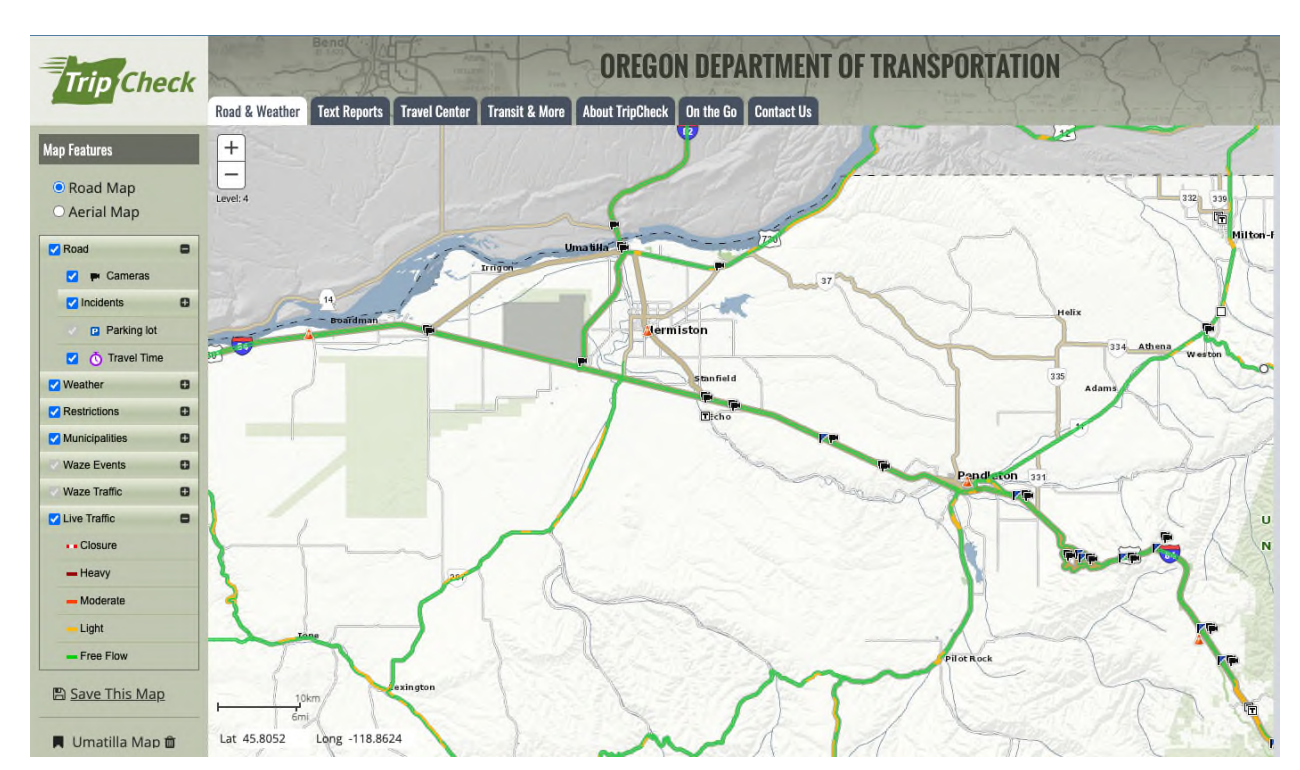
Figure 1: ODOT TripCheck in Umatilla County region

Figure 1 also illustrates the challenges that Umatilla County hopes to overcome from existing systems and data sources. While the ODOT roadways and more significant, highly utilized regional arterials may have data available from sources like Google and ODOT, the vast majority of the County roads do not have this real-time information available. Umatilla County also desires more immediate access to asset inventory data combined through a single user interface system to this real-time roadway and bridge utilization data, to make informed infrastructure investment decisions. Collectively the system will also provide valuable real-time information to local businesses, particularly those operating larger vehicles including freight and agricultural trucking operations. Many roadway facilities are limited by either weight or turning restrictions that have significant impact on users abilities for timely routes.